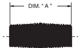
AN-1 to 0