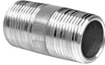
AN - 2B