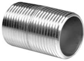
AN-1 to 0