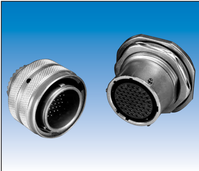
Amphenol® LJT Connector

Amphenol® LJT and JT Series subminiature cylindrical connectors are qualified to MIL-DTL-38999*, Series I and II respectively. These connectors were developed to meet the needs of the aerospace industries, and provided the impetus for development of the MIL-C-38999 specifications, which recently were superseded by MIL-DTL-38999. Meeting or exceeding MIL-DTL-38999 requirements, Amphenol® JT/LJT connectors feature: