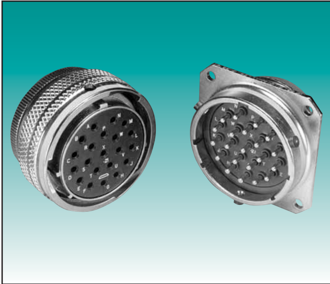
Amphenol® JT Connector

high reliability and high contact density with maximum weight and space savings