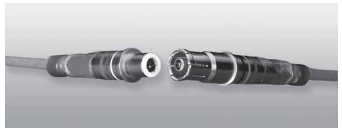
Size 8 Concentric Twinax Contacts Qualified to M39029/90 and /91 (Also available in Size 12)