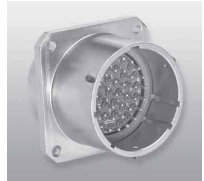
LJT with Filter Protection