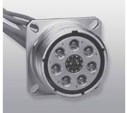
Ground Plane Connector with Metallic Insert, Power Contacts and Shielded Twinax Contacts

For further information on RCT contacts, consult catalog 12-130.