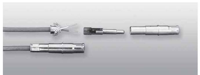
Size 8 RCT (Reduced Component Twinax) Contact (Also available in Size 10)