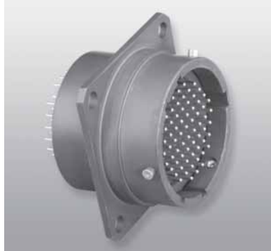
JT with Filter Protection

Filter and/or voltage surge arresting devices are integrated into a JT or an LJT connector to eliminate conventional bulky exterior filtering systems. This unique design reduces weight, space and user testing while providing system protection from EMI/ EMP. Ask for publication 12-120 or contact Amphenol, Sidney, NY for complete information on Amphenol EMI Filter/Transient Protection Connectors.