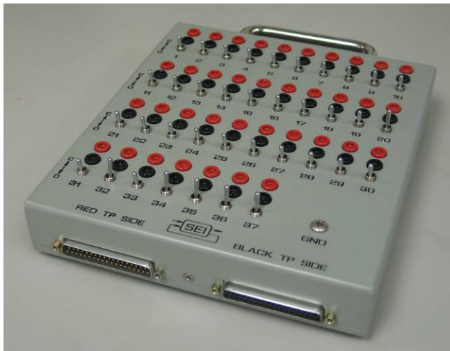
Figure 1 37D Breakout Box with switches PN SE-01007-1