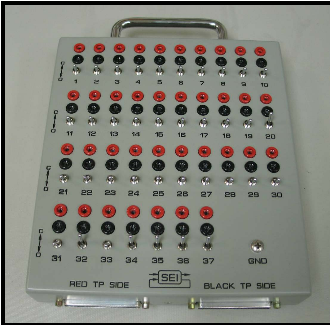
Close up photos of a 37 Pin Breakout Box PN SE-01007